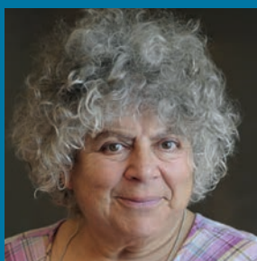
Miriam Margolyes OBE Actress and Age UK Ambassador

'How important it is for all of us that the services we depend on feel safe and welcoming. Unfortunately, for many older people who are lesbian, gay, bisexual or transgender, living through far less enlightened times has meant it is all too easy to expect the worst. This guide offers practical advice on being the kind of service in which older LGBT people can feel safe to be themselves. As well as the bigger issues, it stresses that it is often the simple things that make a difference – being aware, using inclusive language, not making assumptions. I hope it will be widely used.'